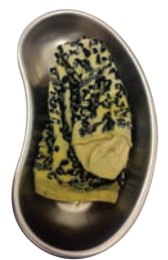
A very expensive sock that was removed from the intestines of a dog

So – as well as trying to ensure your pets don’t eat these objects, we strongly recommend pet insurance to cover you against these unexpected eventualities!